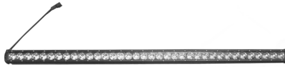
LED light bar

10mm Socket 10mm Wrench Cordless Drill 1/4" Drill bit